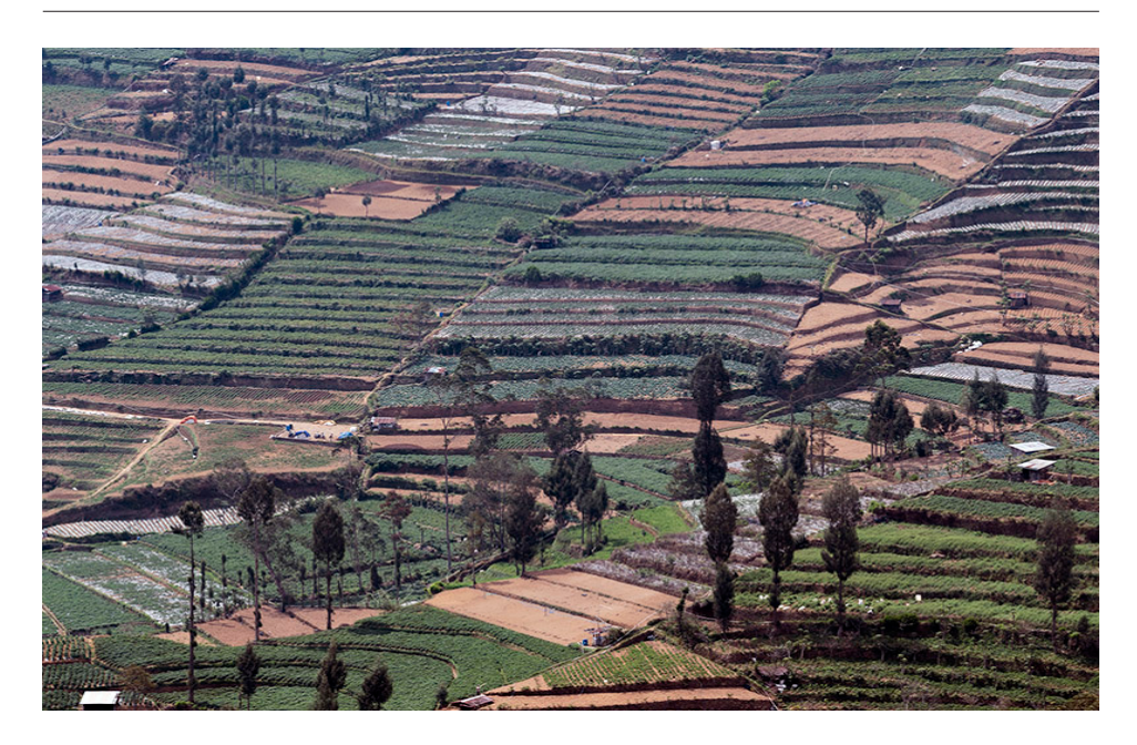
Figure 5. Stripes and Patches of Terraced Landscape Vegetables.