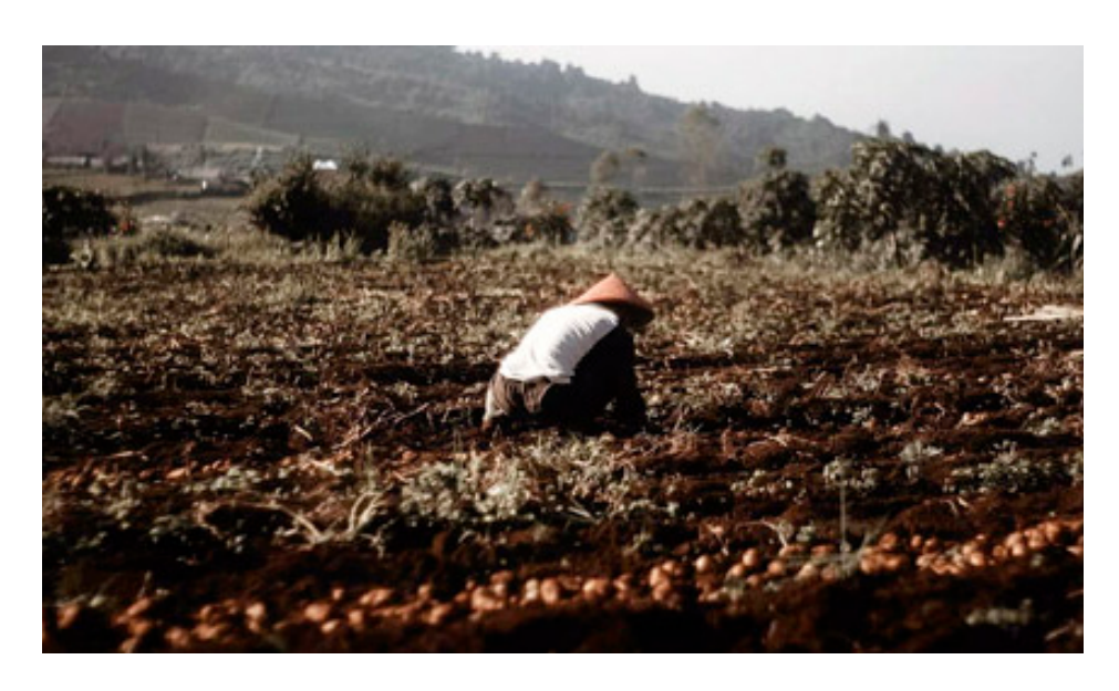
Figure 6. A Peasant's Planting Potatoes.