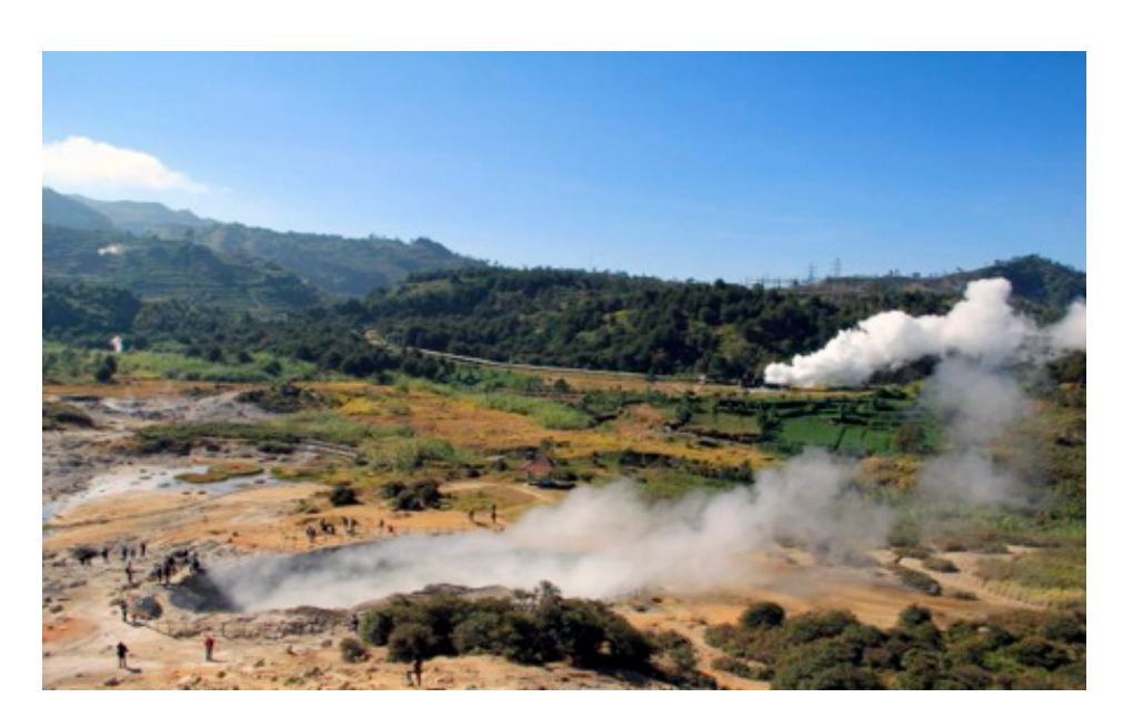
Figure 2. Merdada Lake and Sikidang Crater.