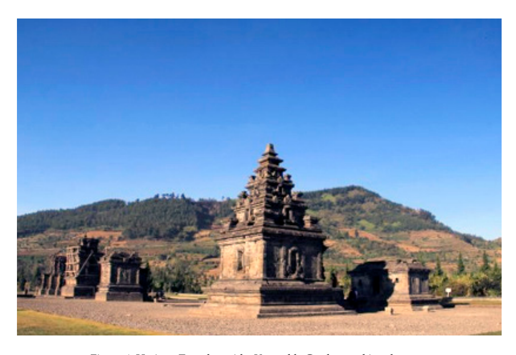
Figure 4. Harjuna Temple amidst Vegetable Garden, and its close up.